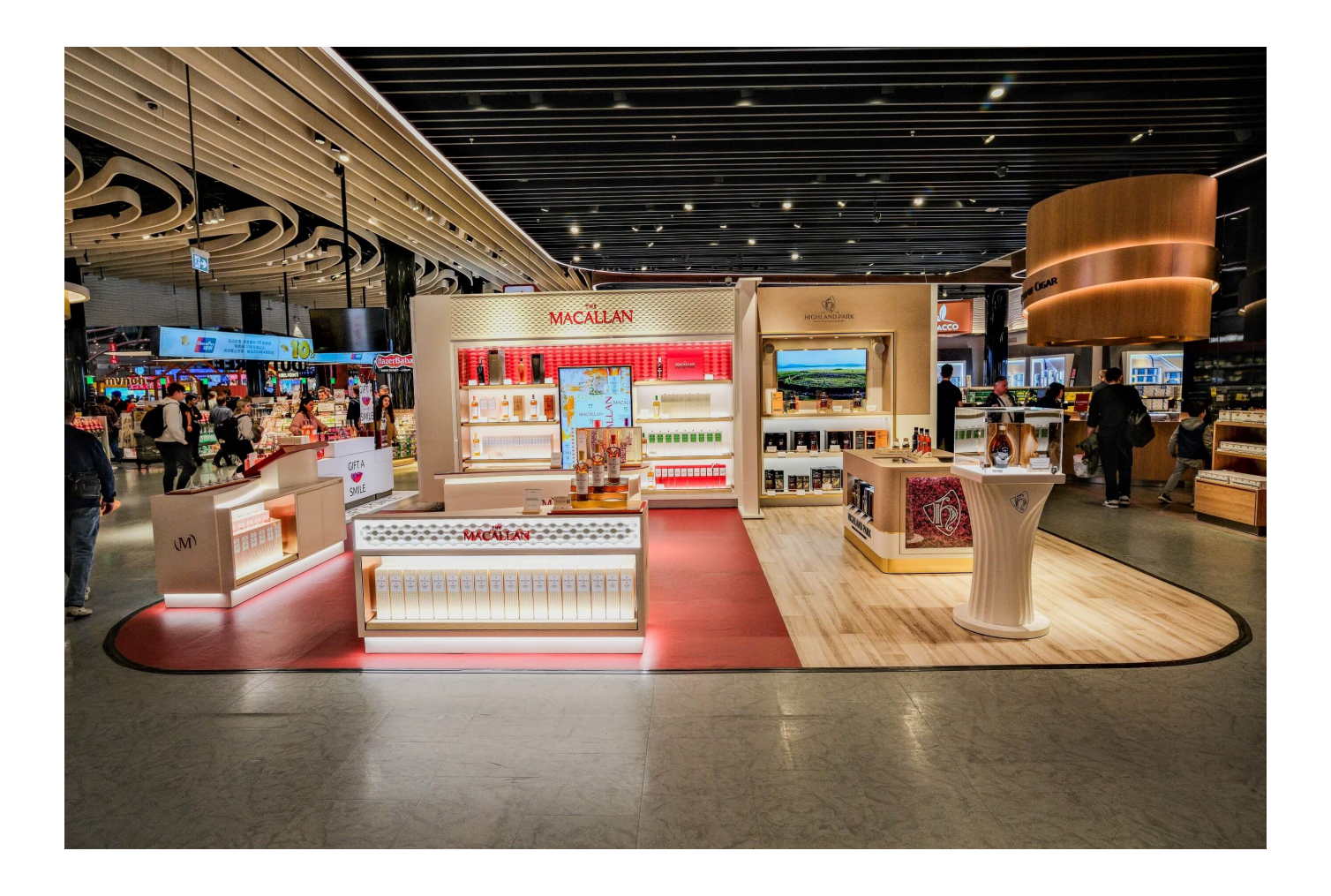
The Macallan welcomes its first shop-in-shop in Europe travel retail

A curated selection of The Macallan single malts is showcased in the space, allowing customers to explore a broad offering of travel exclusives and limited releases that are only available in shop-in-shops. Travel exclusives including Colour Collection and Harmony Collection Green Meadow are joined by limited releases A Night on Earth The Journey and Classic Cut, as well as prestige bottlings including The Macallan M Decanter, M Black and M Copper and archived releases, Masters of Photography 7th Edition and Golden Age of Travel The Car. The seventh release in The Macallan archival series, Folio 7, is also available at the shop-in-shop.